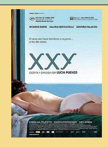
Argentina, 2007, Lucía Puenzo