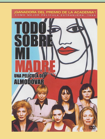
Spain, 1999, Pedro Almodóvar